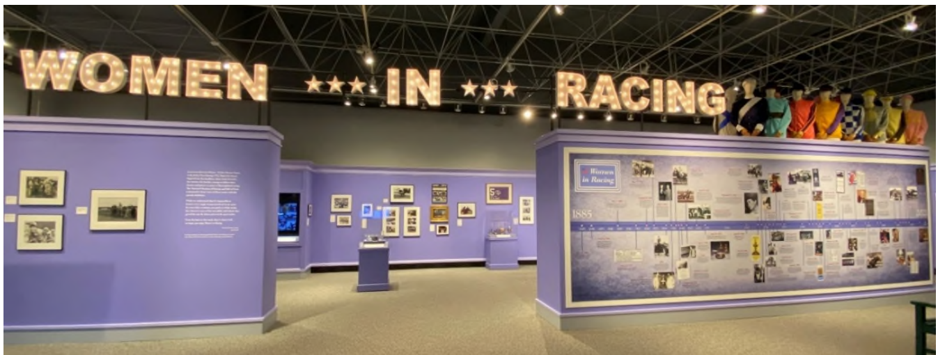
Three featured exhibitions in 2022 (from top right): Muybridge and Motion: Selections from the Tang Teaching Museum Collection , Chasing Summer: The Art of Steeplechase , and Women in Racing .