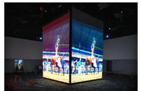
Some scenes from the film "What It Takes: Journey to the Hall of Fame". You must see it for yourself!