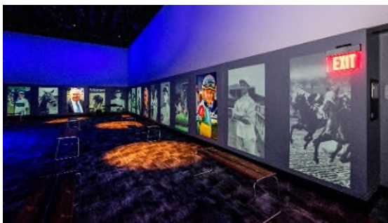
Interactive Monitors in the new Hall of Fame allow visitors to explore the histories of all 459 Hall of Famers.

The project's goal was two-fold: re-energize current racing fans and create new ones. The Museum educates visitors about the history of the sport, captures them with the beauty of the artwork and trophies, and inspires them to share their enthusiasm with others long after their visit. We feel the project achieved its goal.